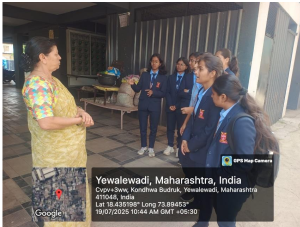
Electricity Awareness visit under Energy club