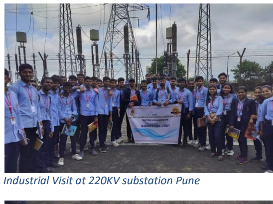
Industrial Visit at 220KV substation Pune