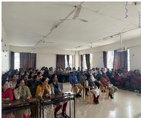
Guru Purnima celebration