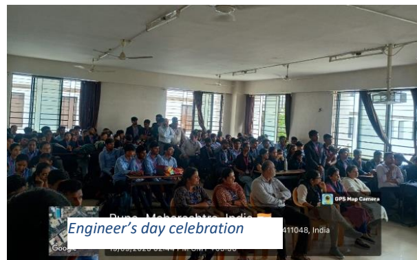
Pune, Maharashtra, India Engineer's day celebration