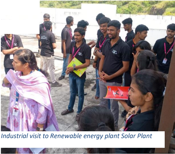
Industrial visit to Renewable energy plant Solar Plant