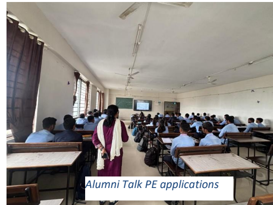
Alumni Talk PE applications