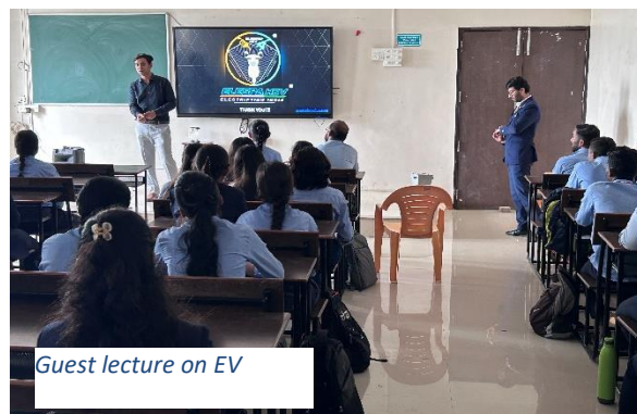
Guest lecture on EV