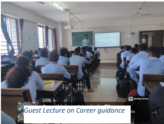
Pune, Maharashtra, India Guest Lecture on Career guidance