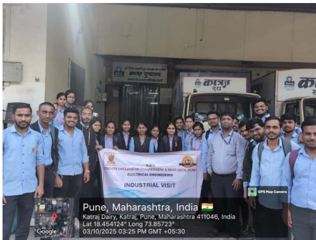
Industrial visit at Katraj Dairy, Pune Zillha Sahakari Duh Utpadak Sangh Ltd