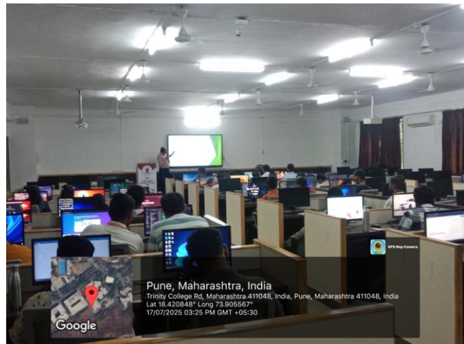
Resume building workshop