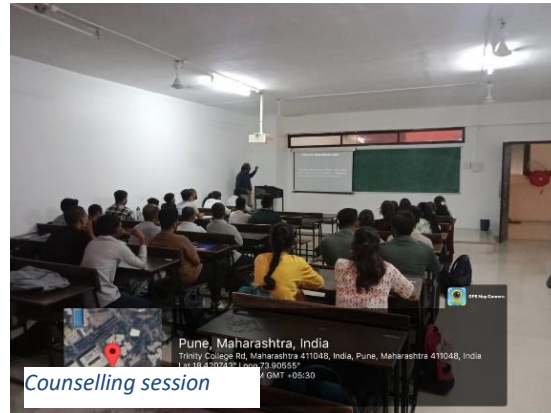
Pune, Maharashtra, India Counselling session