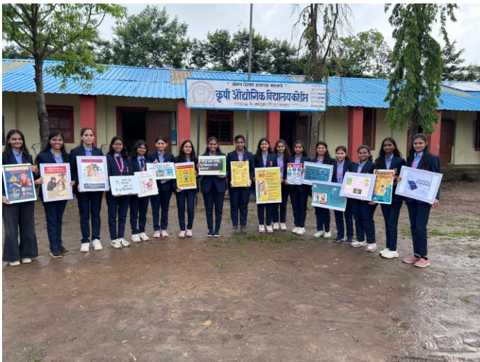
Awareness program on Electrical Safety, Power Theft and Potential of Renewable Energy