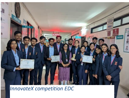
InnovateX competition EDC