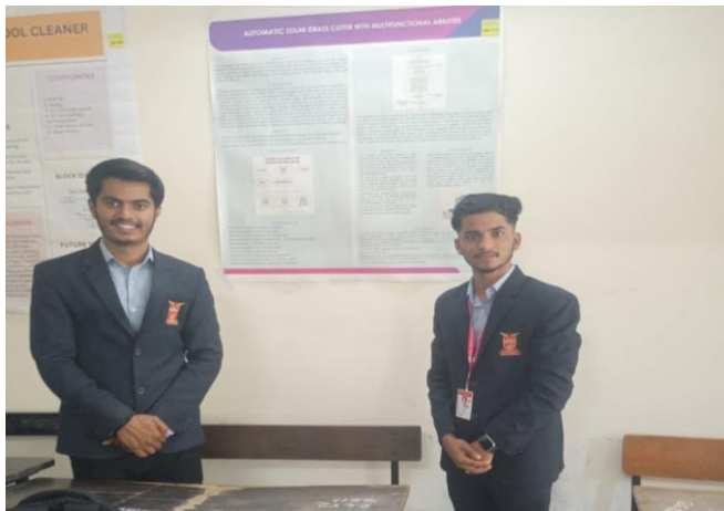
Avishkar zonal level project competition participation