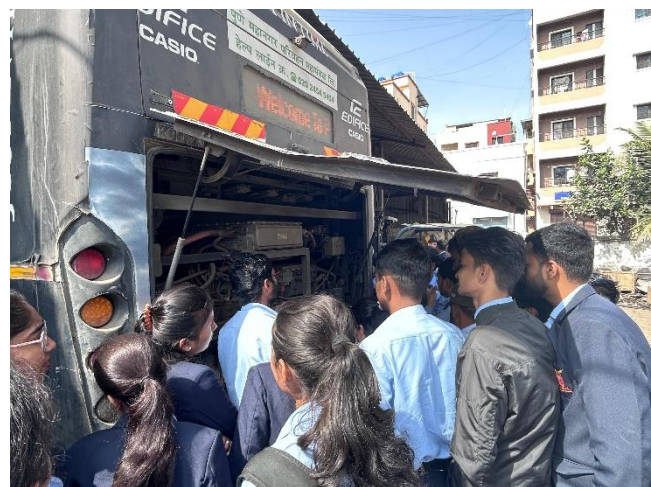
Industrial Visit to PMPML EV bus charging station at Bhekrainagar