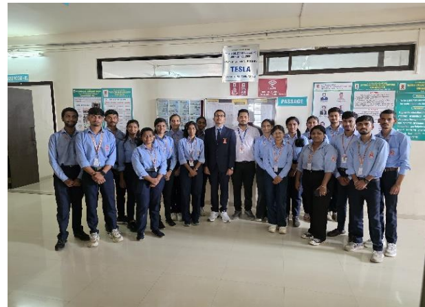
TESLA and energy club reformation