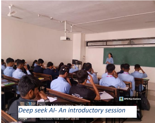
Pune, Maharashtra, India Deep seek AI- An introductory session