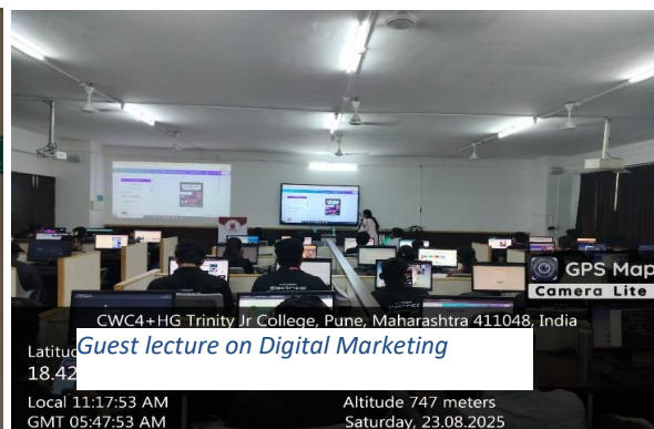
Guest lecture on Digital Marketing

CWC4+HG Trinity Jr College, Pune, Maharashtra 411048, India Latitude 18.42 Local 11:17:53 AM GMT 05:47:53 AM Altitude 747 meters Saturday, 23.08.2025