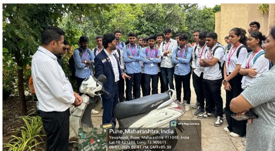
EV lecture international youth skill day