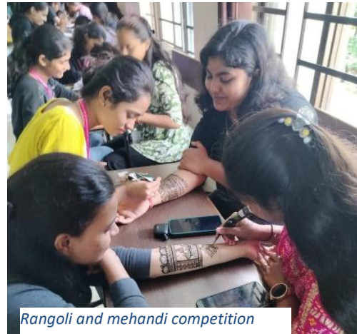
Rangoli and mehendi competition