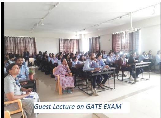
Guest Lecture on GATE EXAM