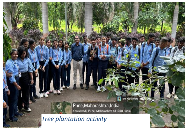
Tree plantation activity