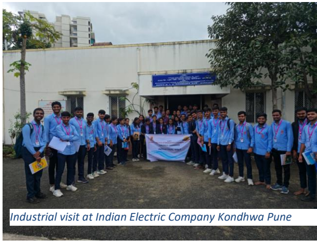
Industrial visit at Indian Electric Company Kondhwa Pune