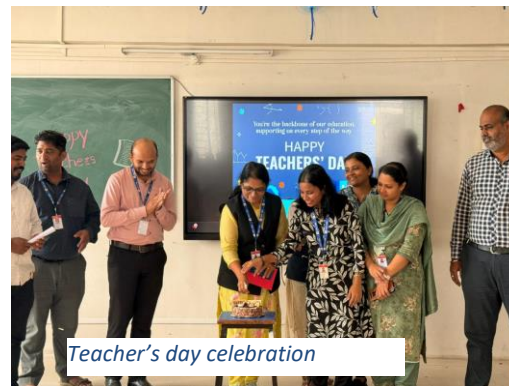
Teacher's day celebration