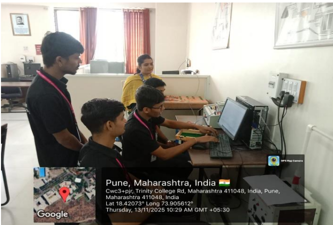
PIC Microcontroller workshop